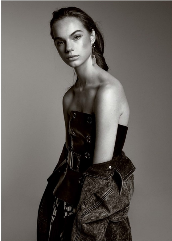
DENIM COAT VERONIQUE LEROY. LEATHER BUSTIER MUGLER. EARRINGS EDDIE BORGO. RIGHT PAGE: DENIM COAT VERONIQUE LEROY. LEATHER BUSTIER MUGLER. PLEATED SKIRT PROENZA SCHOULER. EARRINGS EDDIE BORGO. BOOTS ISABEL MARANT ETOILE.