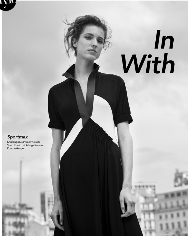
Sportmax Knielanges, schwarz-weißes Stretchkleid mit königsblauem Kontrastkragen.