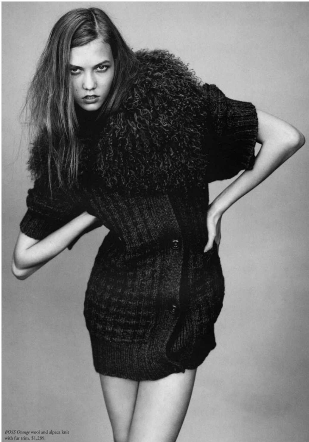
BOSS Orange wool and alpaca knit with fur trim, $1,289.