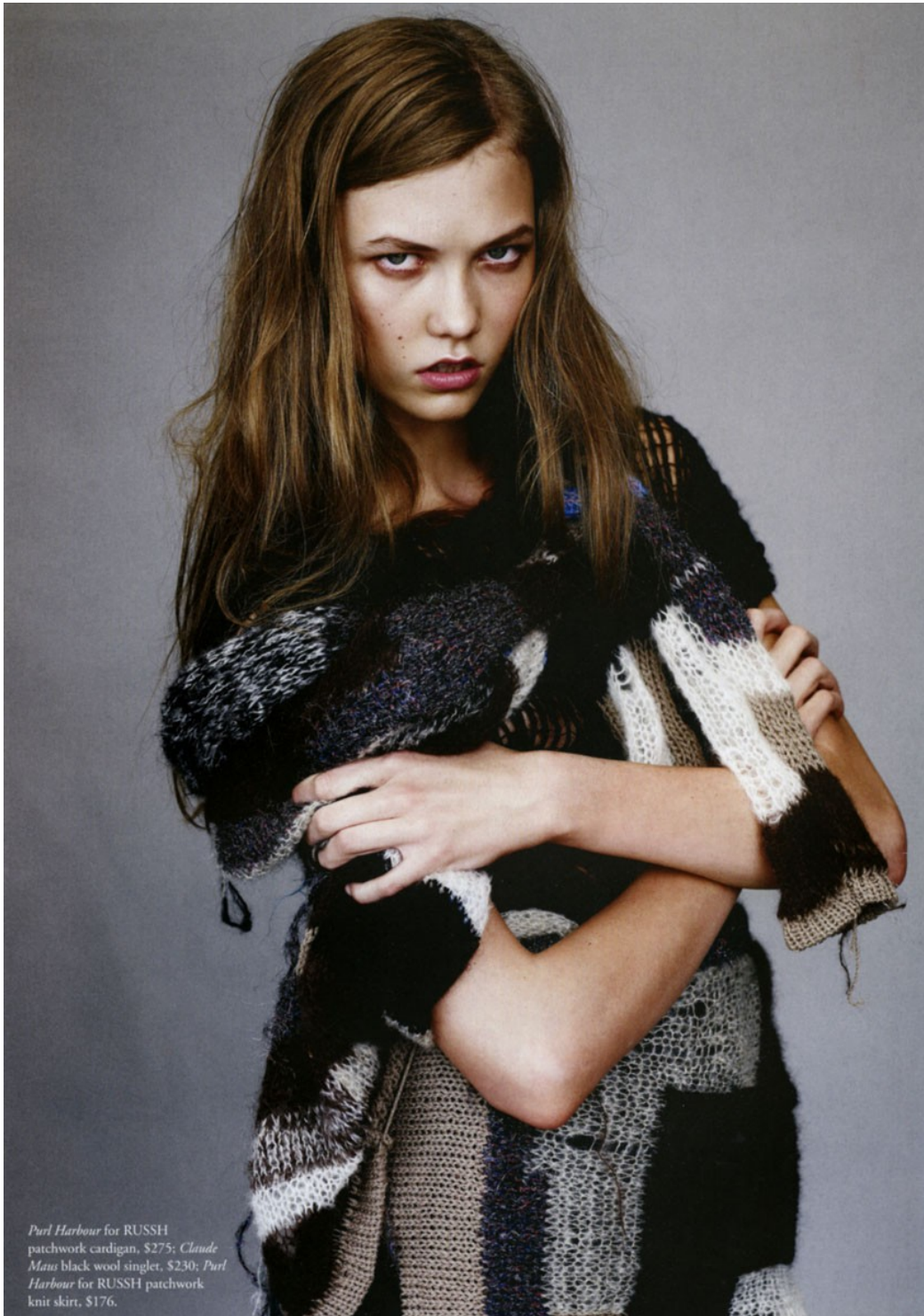
Purl Harbour for RUSSH patchwork cardigan, $275; Claude Mauu black wool singlet, $230; Purl Harbour for RUSSH patchwork knit skirt, $176.