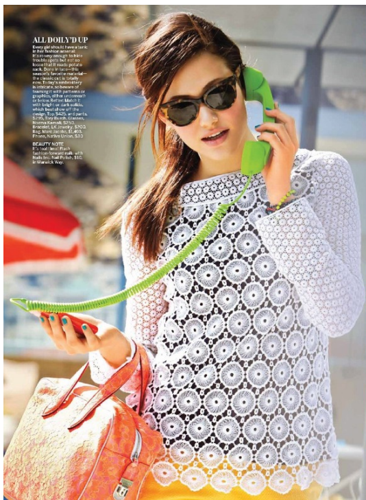
ALL BOILY'D UP Every girl should have a look that says "I'm not a girl, I'm a woman." This woman's look is no exception. She's wearing a white lace top and sunglasses, talking on a green corded phone. She is holding an orange handbag.