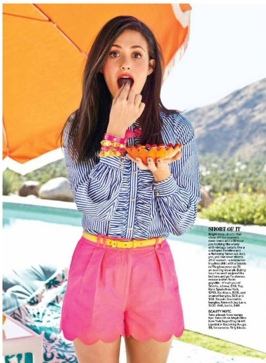
SHORT OF IT Bright pink is hot this season, and this woman's look is no exception. She's wearing a striped button-down shirt tucked into bright pink shorts, holding a plate of colorful appetizers and eating one. She's outdoors near a swimming pool with a large orange umbrella in the background.