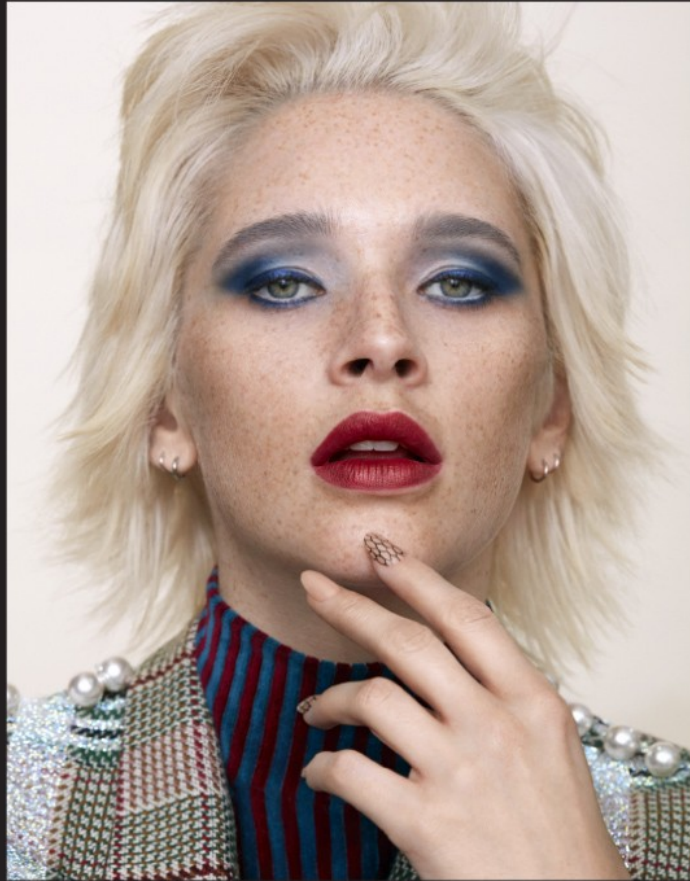
FACE: Radiant Creamy Concealer, NARS; Le Beige in Medium, CHANEL. EYES: Velvet Eyeliner in Les Petites, Velvet Eyeliner in Blue Lotus, Dual Intensity Eye Shadow in Cremilla and Velvet Shadow Stick in Galice, NARS; Le Volume de CHANEL Mascara in Noir, CHANEL. LIPS: Rouge Allure Ink in Choquet, CHANEL.

Striped velvet turtleneck and plaid jacket with pearls, SNOW XTE 640.