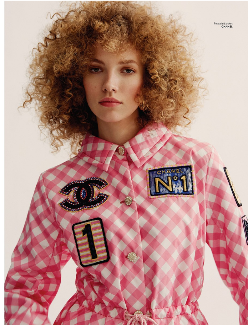
Pink plaid jacket CHANEL