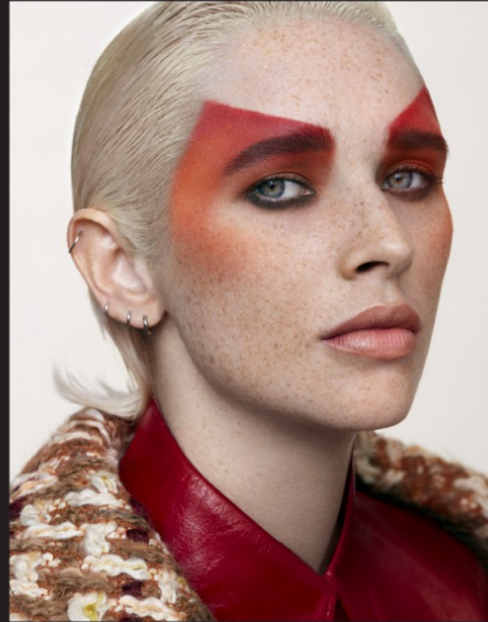
FACE: Touche Eclat, YSL BEAUTY. EYES: Artistic Color Shadow in Tomato, Artistic Color Shadow in Orange, Artistic Color Shadow in Red Brown and Smoky Lash, MAKE UP FOR EVER. LIPS: Artist Rouge Matt in Cream Beige, MAKE UP FOR EVER.

Striped velvet turtleneck and plaid jacket with pearls, SNOW XTE 640.