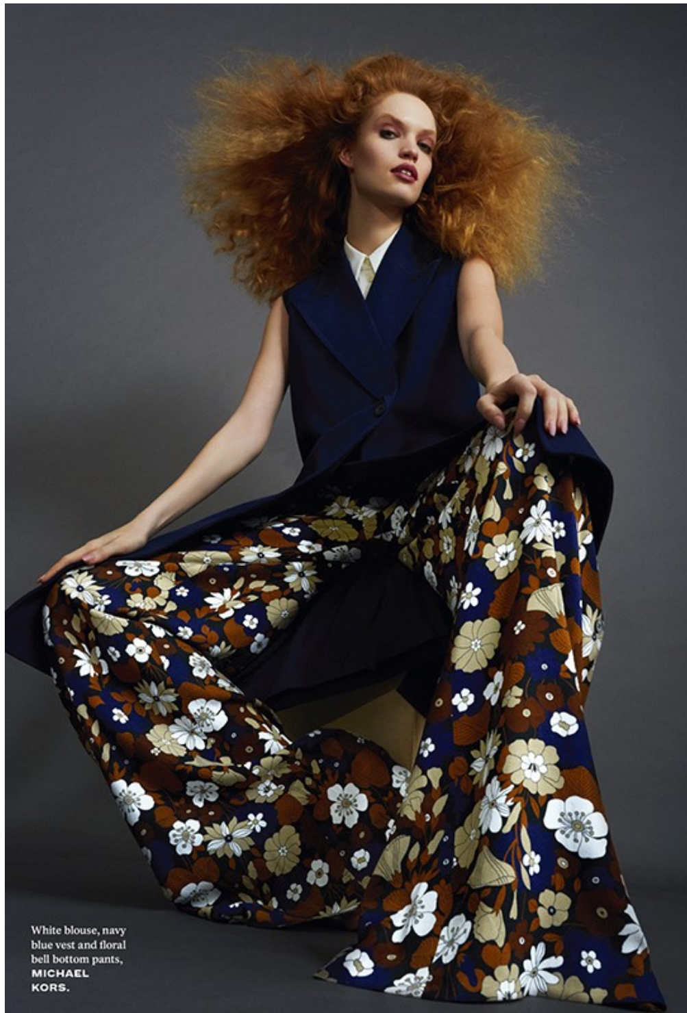
White blouse, navy blue vest and floral bell bottom pants, MICHAEL KORS.