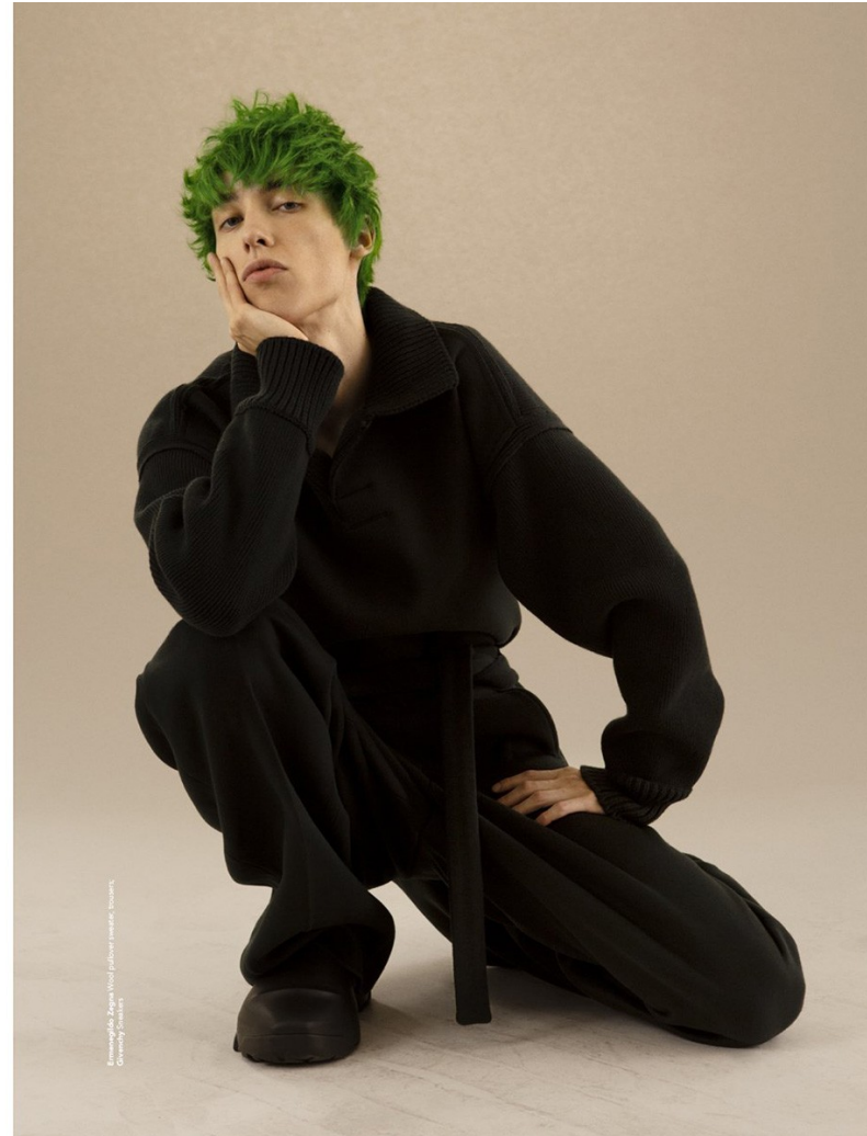
Emeraldglitz, Aztec Wool, rubber sneakers, boots, Jewelry, glasses