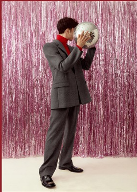
Balenoaga Mixed fabric suit, cashmere turtleneck, leather shoes, gold earring