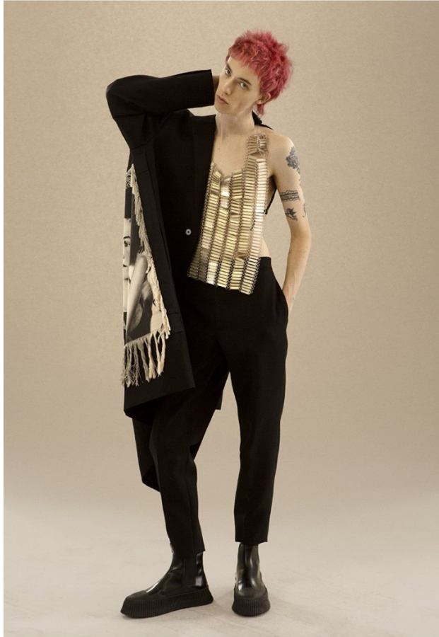
JT Sweater, Silver plate beads, platinum, wood coat, wood trousers, boots