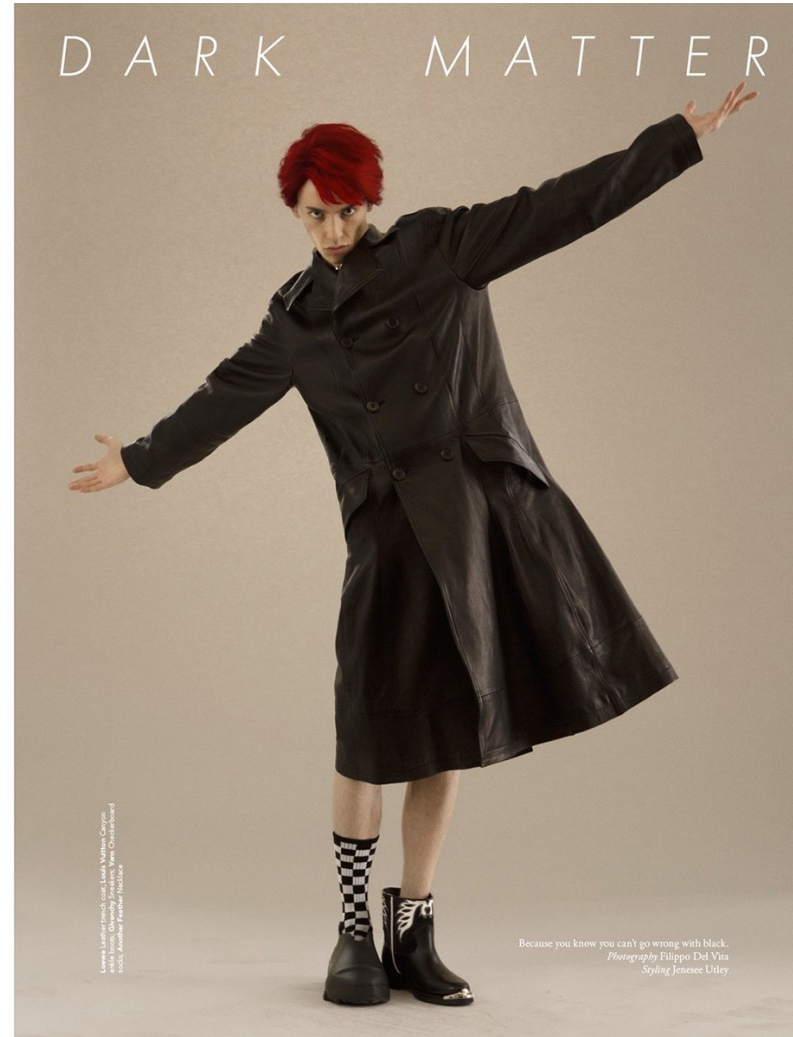
Levante leather trench coat, Grand Line shirt, velvet trousers, checkered socks, leather boots, leather bag