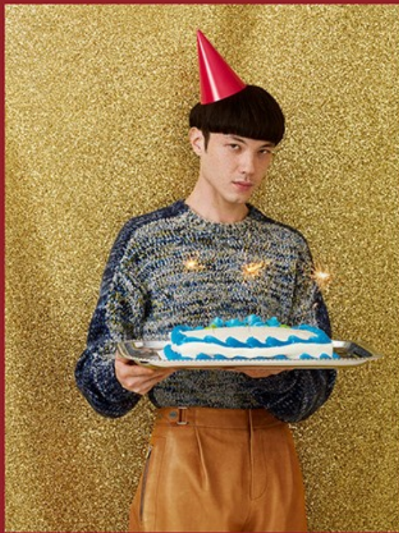
Hermès Knit sweater, leather trousers