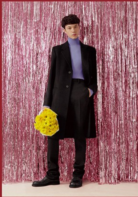
Bottega Veneta Cashmere long coat, wool trousers, knit turtleneck, calfskin boots