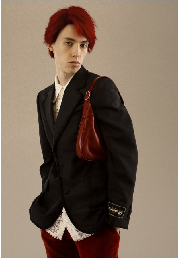
Grand Line shirt, blazer, velvet trousers, leather bag