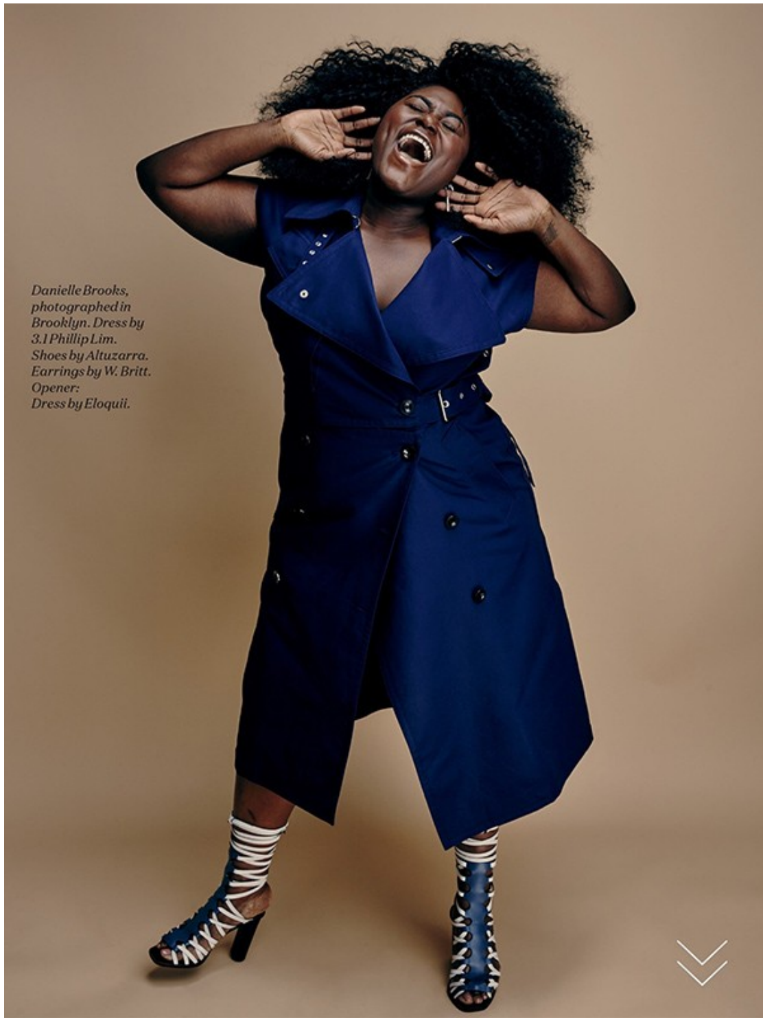
Danielle Brooks, photographed in Brooklyn. Dress by 3.1 Phillip Lim. Shoes by Altuzarra. Earrings by W. Britt. Opener: Dress by Eloquii.